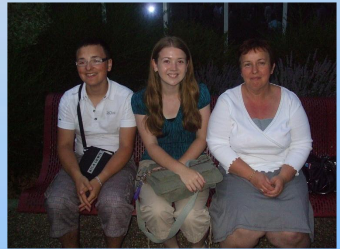
My host family and me after the Fête des Familles.

I spent six and a half weeks in Saumur with 16 other students and three teachers. The experiences and memories made will stay with me my entire life.