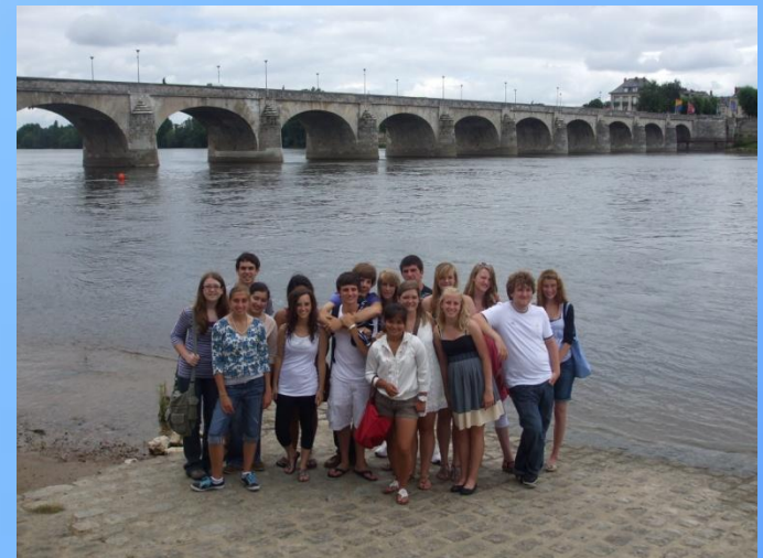
All the stagiaires (students) by the Loire River.